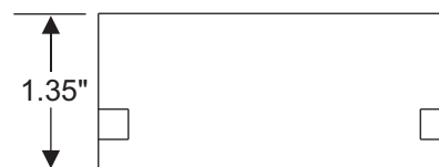
Ballast Wiring Diagram